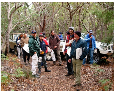
ALBAA members looking happy about being able to drive out to Big Beecroft!