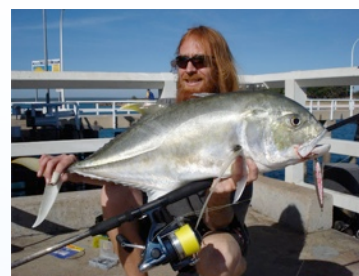
Darwin Jetty GT's!

While the NSW scene is slowing down the NT is starting to fire. Member Blue13 hooked the fish off the bottom and in close vicinity to pylons, where in true GT fashion it was determined to stay. After a few minutes the fish, still very green, succumbed under 7kgs of drag pressure and landed by a brilliant gaff shot (Thanks Sizie). Caught on a Dakau 11' Longtail, "the rod has a great curve loaded up and the length helped keep the fish away from the pylons. Although the fish was straight down, the rod felt comfortable and easy to control even with the high drag setting". Product testing NT style!