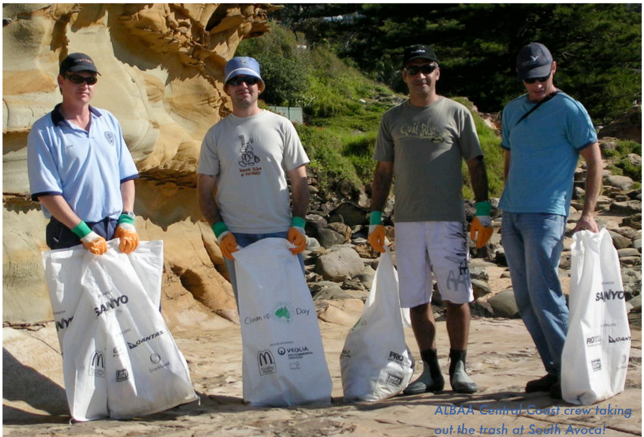
ALBAA Central Coast crew taking out the trash at South Avoca!