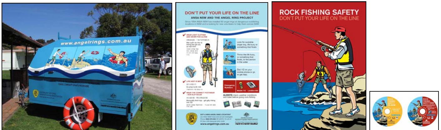
Rock Safety Educational and Awareness Material developed by NSW ANSA, NSWRFA and Commonwealth Government.

In the spirit of public consultation and co-management ALBAA would like to work with the Booderee National Park management to develop a code of practice for recreational angling within the Park. In partnership with ANSA, RFAA and ALBAA, Booderee National Park could be supplied with the rock safety educational and awareness material to be distributed to visiting recreational anglers, along with assistance in the installation of rock safety infrastructure.