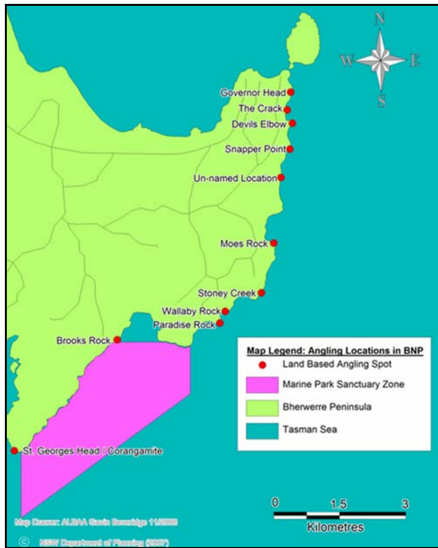
Key land based angling locations along the coastline of Booderee National Park

LBG anglers fish off rock platforms that provide angling opportunities unique to the Jervis Bay coastline and not available anywhere else in the world. The current management of the Jervis Bay coastline has essentially locked LBG anglers out of areas that are so unique no replacements are available. ALBAA requests that anglers are granted greater access to the coastline of Booderee National Park so as to provide the ability to maintain the cultural and historical significance of the recreational activity in a safe and sustainable manner. To assist the management of Booderee National Park in this request ALBAA has constructed a map identifying the key land based angling locations previously utilised by anglers prior to the implementation of the current Plan of Management.