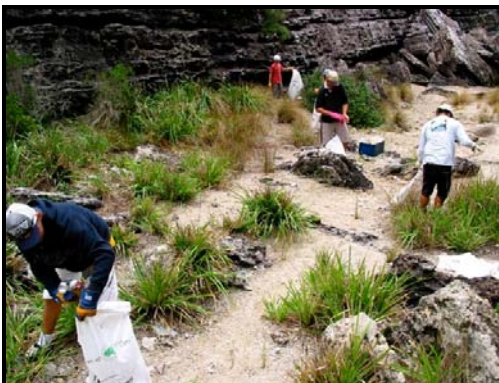
ALBAA 'Ledge Care Initiative' being implemented at Jervis Bay.

ALBAA is committed to working with management bodies to identify areas of concern and develop strategies to address these in a timely and sustainable manner. As a result of this commitment, the proactive 'Ledge Care Initiative' has been established, to meet a number of ALBAA's core objectives, through the promotion of local environmental awareness and stewardship. Localised area action groups provide a vehicle for ALBAA members to engage management bodies and stakeholders, and carry out grassroots environmental actions within their respective areas. These groups are capable of implementing, monitoring and managing actions within their designated areas. ALBAA supports the development of a code of conduct to guide their activities within Booderee National Park, and believes that the adoption of a co-management philosophy would benefit all of the Parks stakeholders.